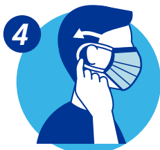
Secure strings behind your head or over your ears