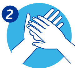
Rub hands together