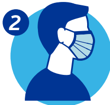
Ensure the proper side of mask faces outwards