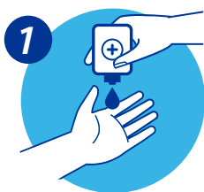
Apply sanitizer on the palm of one hand