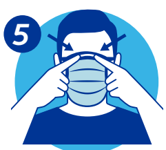
Press the metal strip to fit the shape of the nose