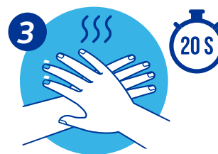
Cover all surfaces until hands feel dry (20 seconds)