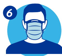
Check seal and ready to go

To learn more about our resident visitation policy and requirements, go to: lorettocny.org/visitation