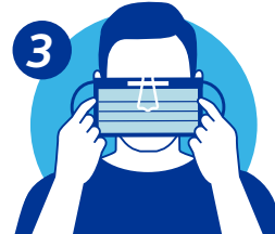
Locate the metal strip and place on the nose bridge