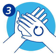
Wash hands for 20 seconds