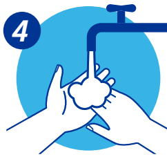
Rinse off soap