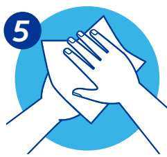
Dry hands with a towel