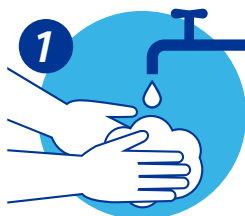
Wash your hands before wearing mask