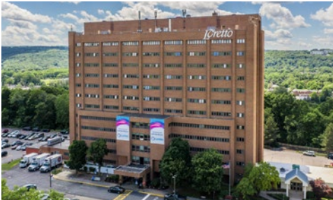
Memory Life Care at Loretto Health & Rehabilitation 700 E. Brighton Avenue, 11th floor, Syracuse, NY 13205