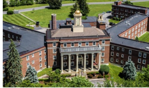
The Heritage Memory Life Community 750 E. Brighton Avenue, Syracuse, NY 13205