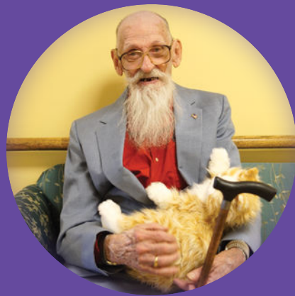
Lifelike Robotic Pets