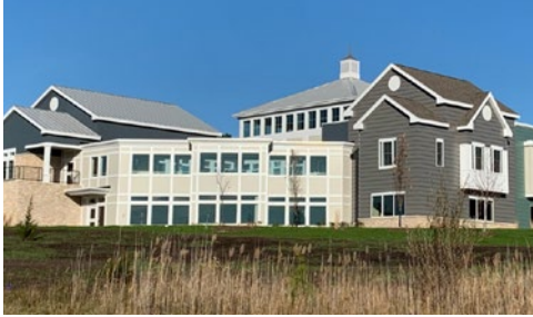
The Borer Memory Life Community 1301 Nottingham Road, Jamesville, NY 13078