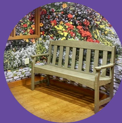
Environmental Design Enhancements