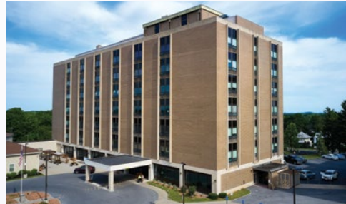
Memory Life Care at The Commons on St. Anthony 3 Saint Anthony Street, Auburn, NY 13201

To learn more about our Memory Life Communities, please contact: