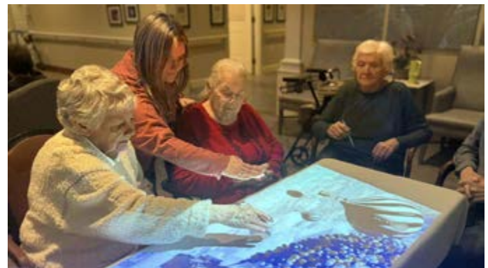
Residents at the Borer Memory Life Community at the Nottingham gather around the Lucynt technology table, engaging their minds, sparking conversation, and rediscovering connection through innovative, interactive experiences.

Thanks to an anonymous donor, Borer Memory Life Community at The Nottingham recently received Lucynt Mobile Pro, a software platform and gaming system that features more than 160 games and activities that provide cognitive stimulation, encourage physical activity, and promote social interaction. Residents enjoy interactive activities, and families appreciate the opportunity to do something together with their loved one when they visit. Because of donors like you, innovative tools like this continue to bring connection, engagement, and moments of joy to residents and their families every single day.